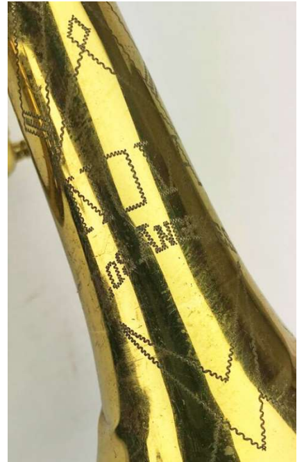
Cornet #18170 below and right